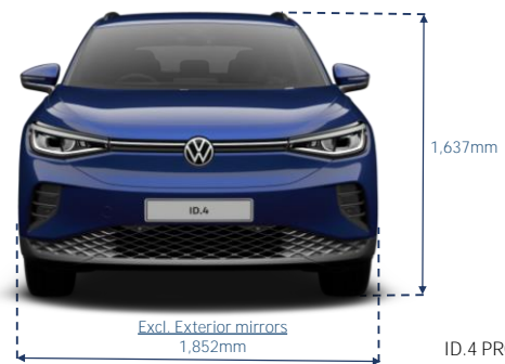
ID.4 PRO+ shown