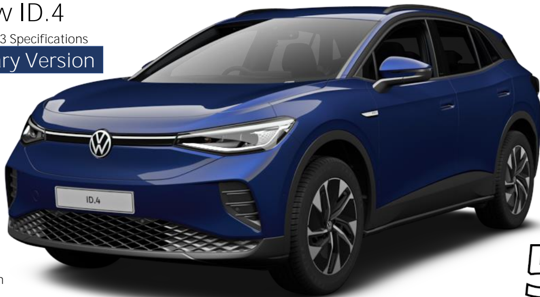
ID.4 PRO+ shown